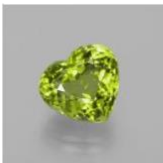
A little beauty: 5.71 ct for ‘only’ US$369

The word Peridot (apparently pronounced pear-a-doe) derives from the Greek word “faridat” which means ‘gem’. Due to it’s pale green colour this stone is often referred to as ‘poor man’s emerald’.