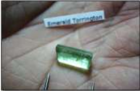
A green Beauty found at Torrington 5.1 carats

We had great weather until mid-day Friday, when it started raining and continued until Sunday. Consequently the grounds in the park became water logged and turned to slush in places. Some members departed for home early as a consequence, but for those diehards (or try-hards), who stayed, the sunshine finally reappeared and fossicking continued unabated.