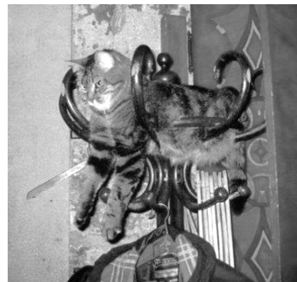
Dogs can't do this