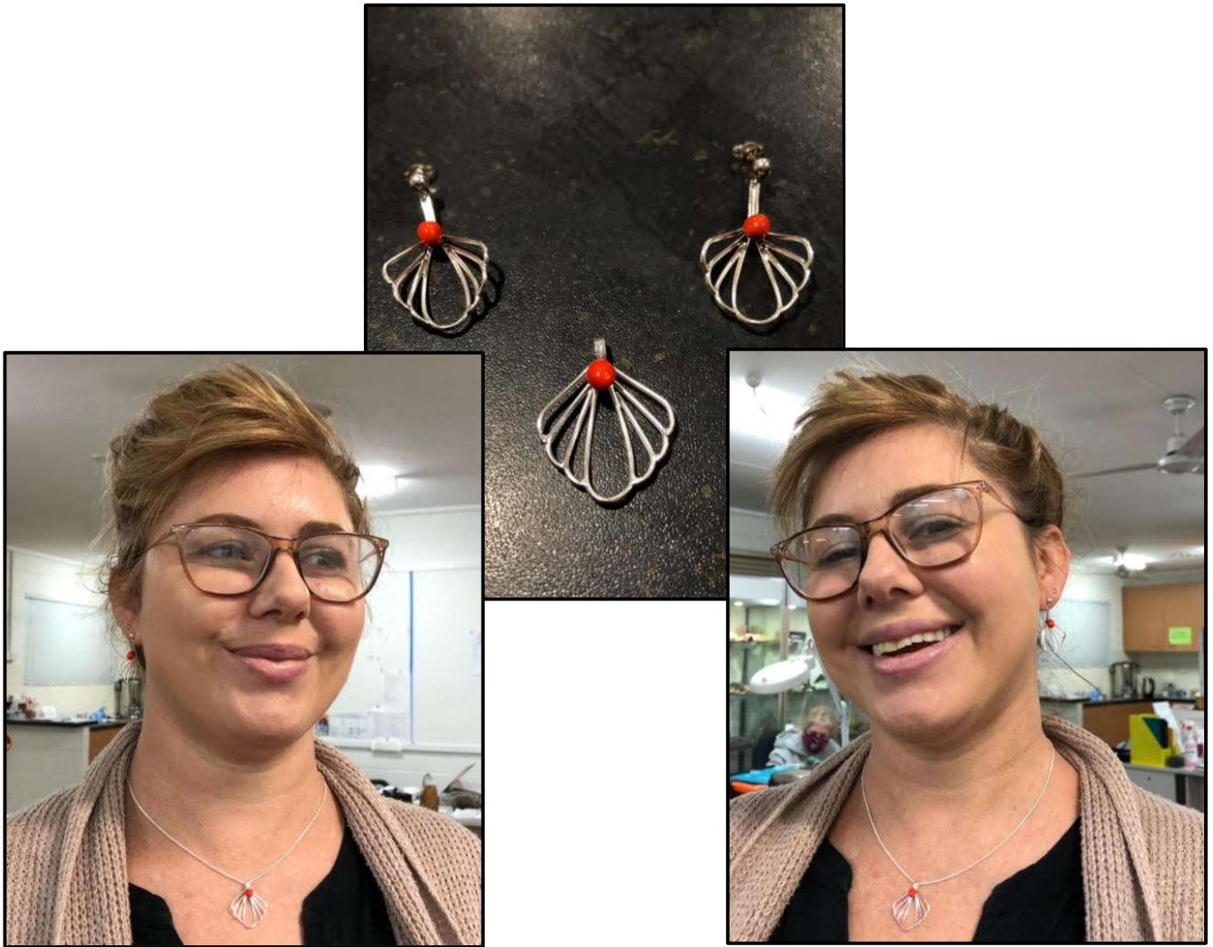
Thierry's Scallop Shell Pendant and Earring Set, as modelled by Melody