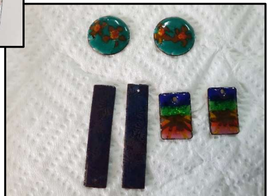
Our lovely club members and their silver foil enameling technique creations.